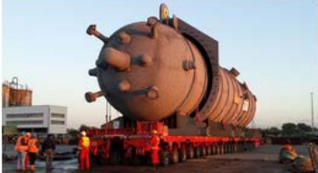
CHEMICAL, PETROCHEMICAL & FERTILIZERS