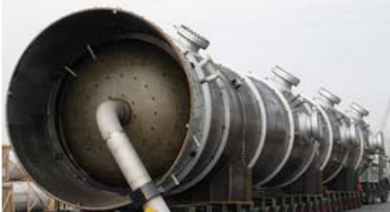
OIL & GAS (ONSHORE & OFFSHORE)